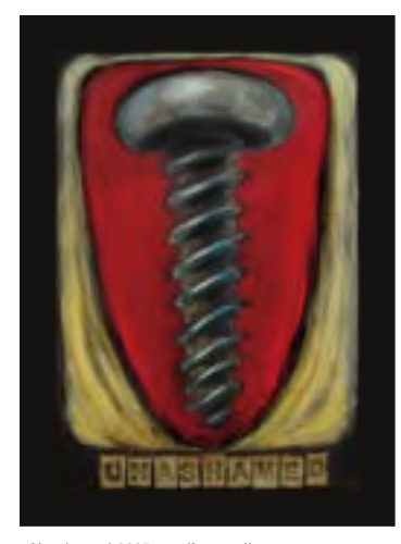
Unashamed, 2007, acrylic, pencil and clay on masonite, 5"X7"