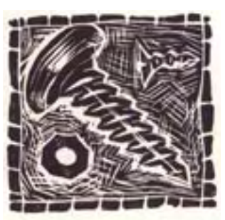
Screws, 2007, block print, ink on paper, 4"X4"

June 15—July 15, 2007 at noFriction Cafe, 2023 N California in Chicago tracytoast@earthlink.net or http://home.comcast.net/~tracytoast/pressroom.html