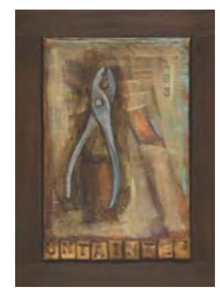
Untainted, 2007, acrylic, pencil and clay on canvas, 5.5"X7.5"