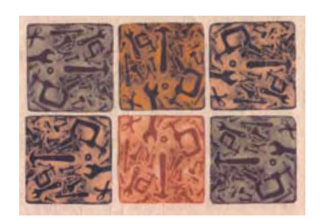
Tools, 2007, heat transfer onto canvas, 9.5"X7"