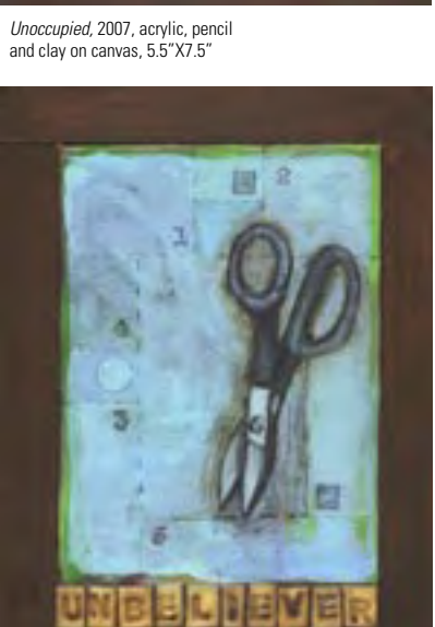
Unbeliever, 2007, acrylic, pencil and clay on canvas, 5.5"X7.5""