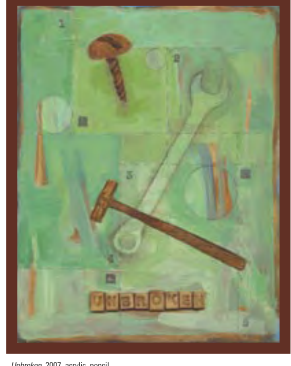
Unbroken, 2007, acrylic, pencil, paper and clay on masonite, 8"X10"